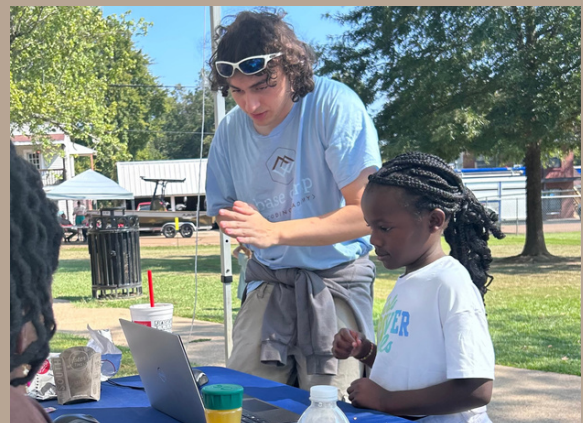
Community Event - Project Safe Kids