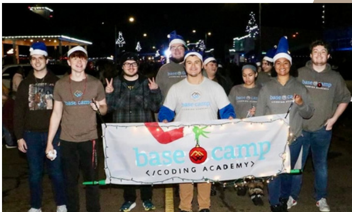
2023 Water Valley Christmas Parade